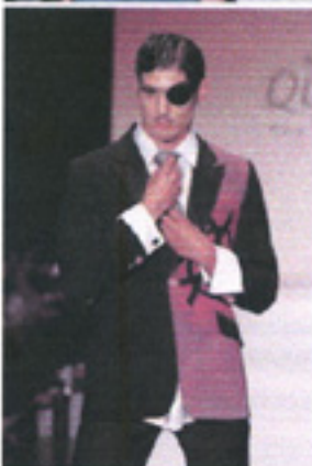
(top) Giddyup Fancy Pony Land. (Bottom): Argh. No, really, argh. Elmer Ave. swabs the catwalk.